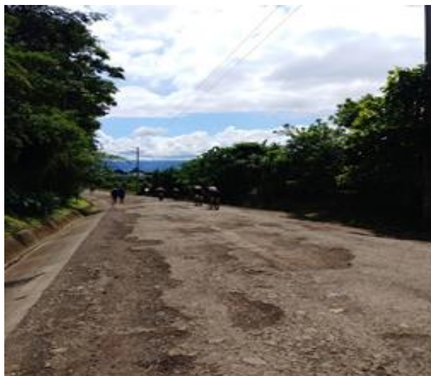
Fig. 5. Group of cyclists and two walkers near Quizarco.

sectors is the polygonal area Quizarco-Tierra Blanca-Casa Vieja-Quebradas, which includes segments of the three routes studied (Fig. 5).