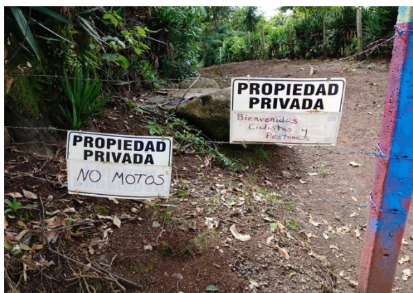
Fig. 6. Signs at the entrance of a private property.

In route Ciénaga-Charquillos, at the entrance to an agricultural farm, dedicated to coffee production, there are two signs of private property. In one sign it is handwritten that both pedestrians and cyclists are welcome to that property (Fig. 6). Such farm is a large area with multiple roads and trails, highly visited by cyclists and hikers. The sign can be interpreted as a support from the owners to those who wants to better handle the adversity generated by the pandemic.